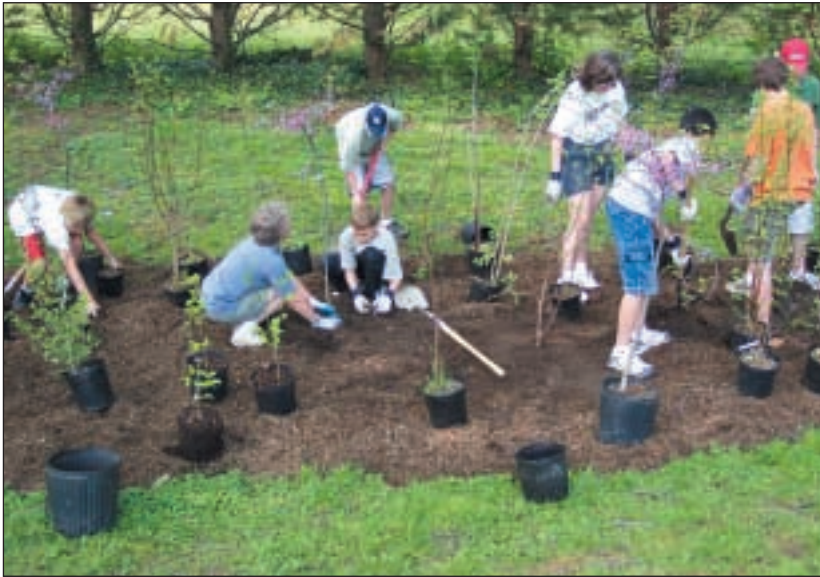
Figure 2. Students and community leaders help plant seedlings to vegetate a rain garden in Kensington, Maryland. Rain gardens such as these are designed to increase infiltration of rainwater into the soil and minimize run-off of nutrient or pollutant-rich water into stormwater systems that feed streams and rivers.

these practices can help sustain ecosystem services, for example through appropriate waste-disposal practices or the use of less environmentally persistent chemicals (Loucks et al. 1999). A recent report by the Council for Environmentally Responsible Economies (CERES), a coalition of environmental, investor, and advocacy groups, examined how 20 of the world's biggest emitters of greenhouse gases are factoring climate change risks and opportunities into their business practices (Cogan 2003). The report features a checklist of specific actions that companies can take to address climate change. Ecologists can play an active role in such projects through direct involvement or through research motivated by the needs of such ventures.