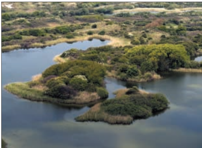
Figure 1. Artificial lakes covering coastal dunes represent ecologically designed systems to provide drinking water for large cities in the Netherlands.

There is a pressing need for further collaborations between ecologists and corporations, governmental agencies, and advocacy groups, at local and international levels. Business practices have substantial impacts on the environment, but if informed by ecological knowledge,